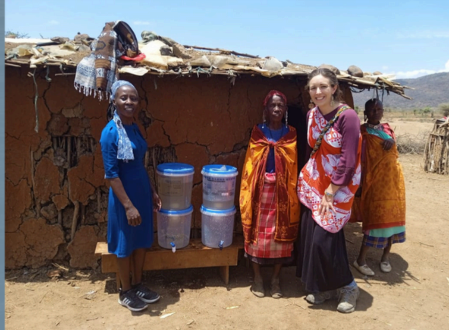
"When I go to Kenya, I provide support for Africa Hope's ministry to the Maasai through clean drinking water."