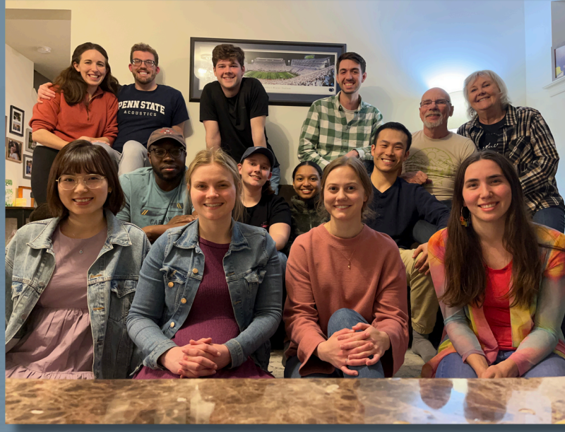
"Small group family (almost everyone pictured here)"