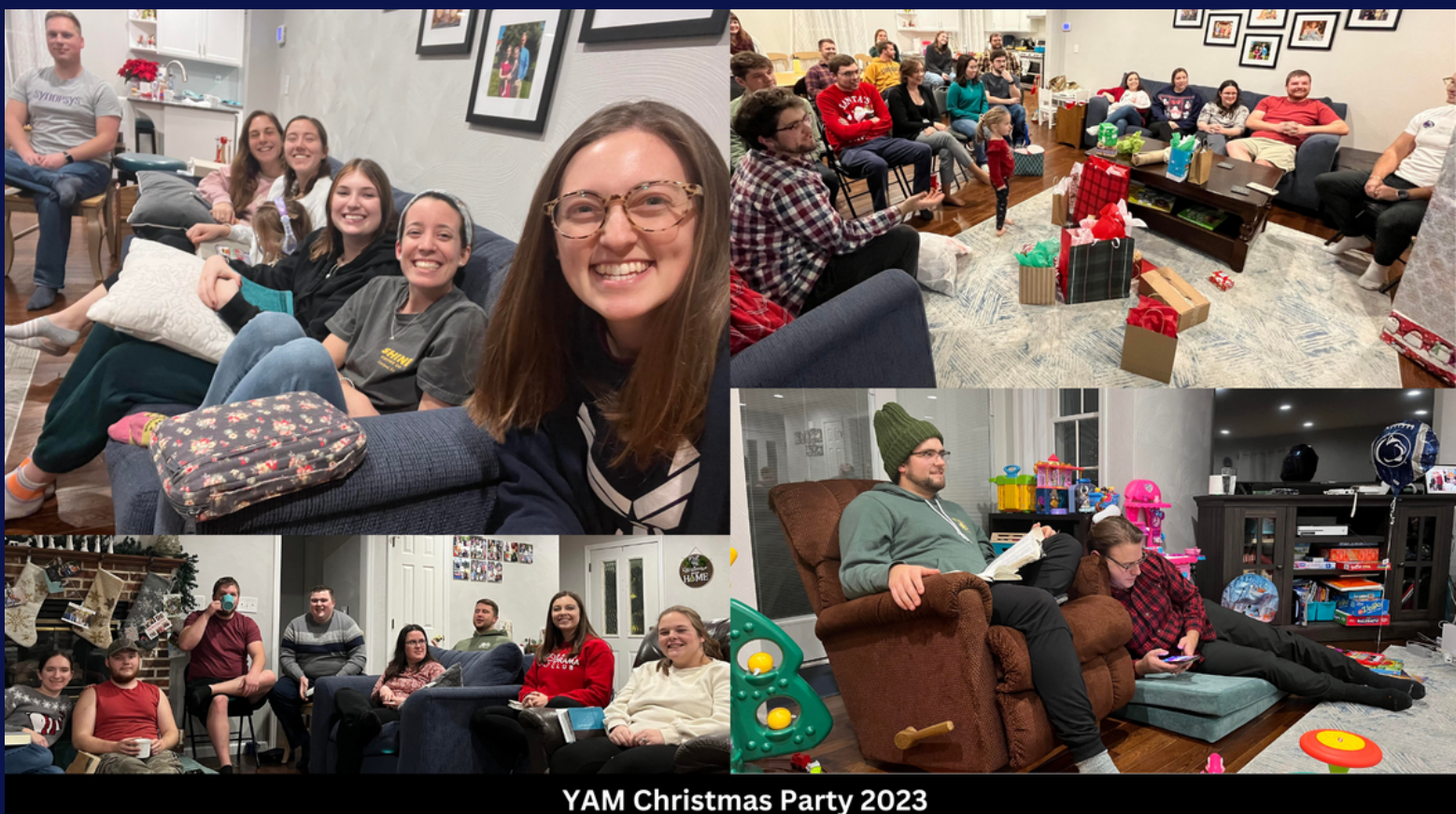
YAM Christmas Party 2023

We enjoyed fellowshiping over tacos, a white elephant gift exchange, competed in Kahoot (including trivia on Christmas, PA, Michael W. Smith albums, and PFBC of course!), along with a few other games.